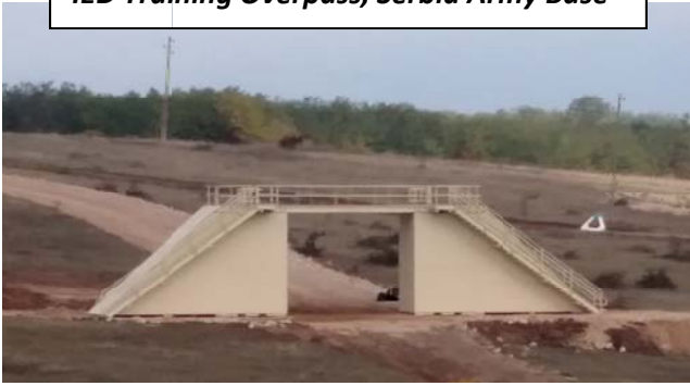
IED Training Overpass, Serbia Army Base