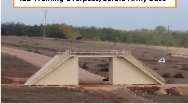
IED Training Overpass, Serbia Army Base