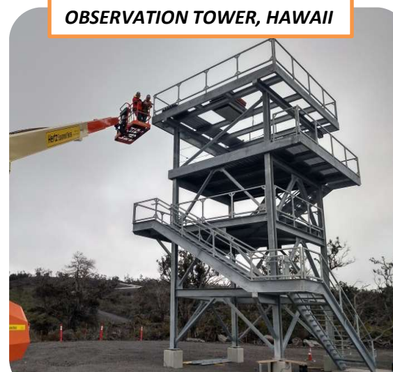
OBSERVATION TOWER, HAWAII